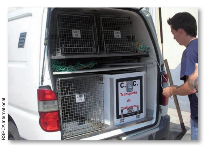
An animal collection vehicle in Coimbra, Portugal.

Transportation time should be factored into the daily working schedule of catching staff. The longer they spend transporting dogs from place of capture to the holding facility, the less time they have for actually catching dogs. Take into account normal traffic congestion and avoid transporting dogs when a high volume of traffic is anticipated.