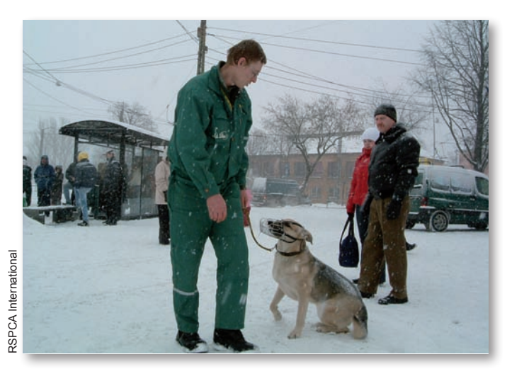
An animal control officer at work in Tallin, Estonia.