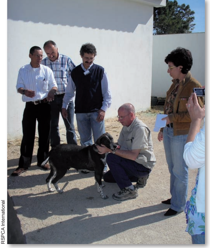
Humane animal handling workshop for municipal staff in Portugal.

Furthermore, office staff should educate residents when reporting lost dogs about responsible pet care, including the benefits of spaying or neutering, the hazards of leaving animals outside unattended and the importance of identification.